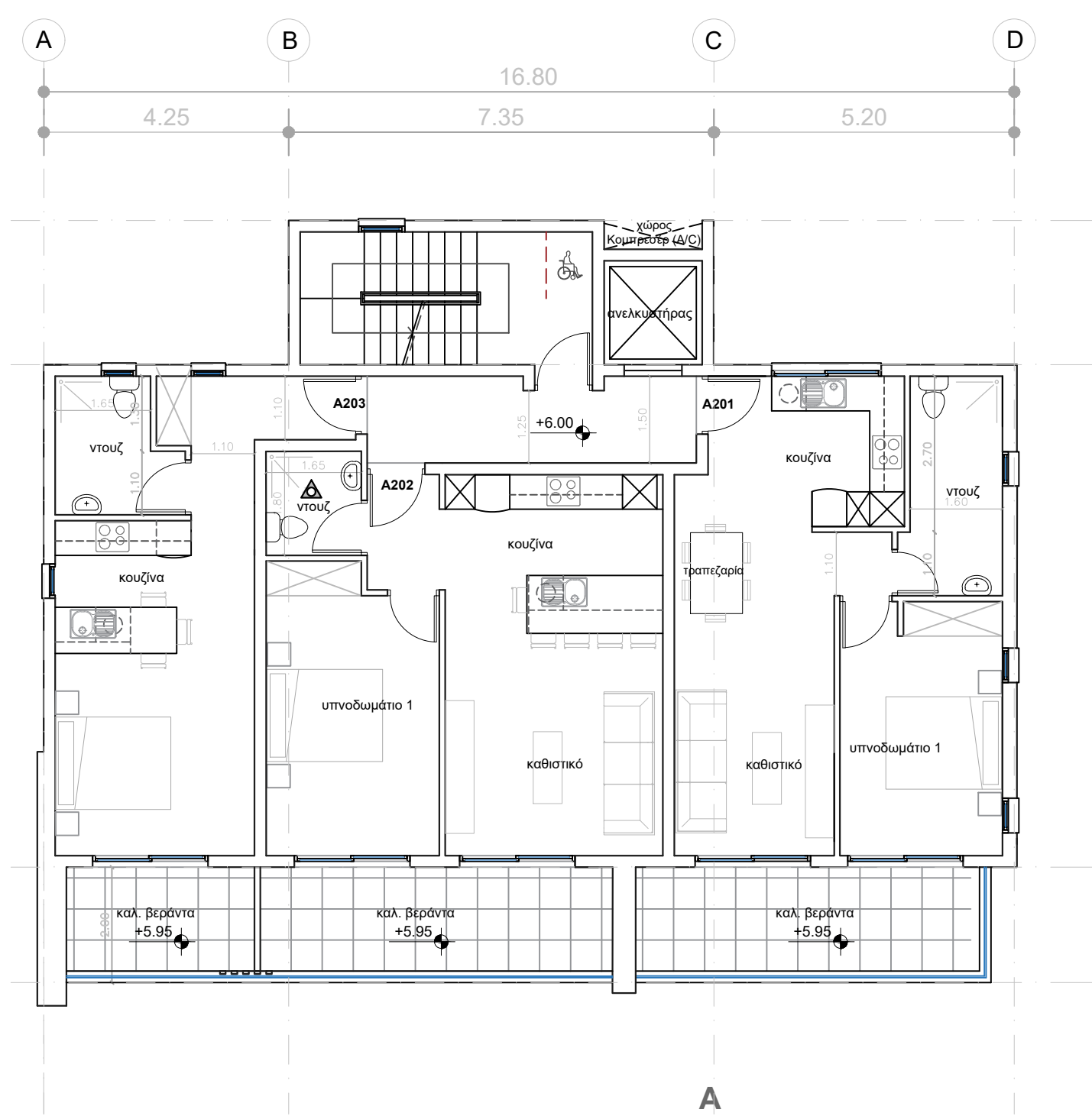
BLOCK A - Second Floor